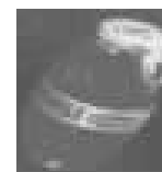
Fig. 23 BOMBA